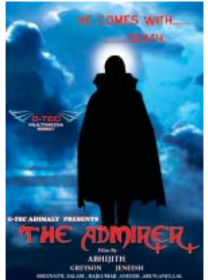
New Feature film by Abhijith & team for G-TEC Multimedia.