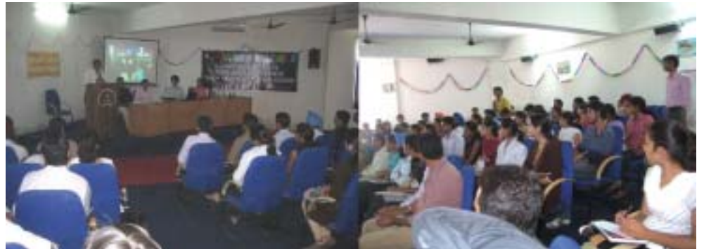
Workshop conducted at an Engineering College in Chandigarh on Career Tracks (21st Sept, 2010)