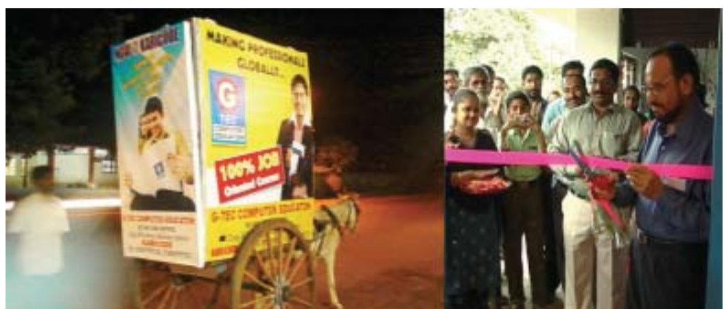
G-TEC Karicode, Kollam