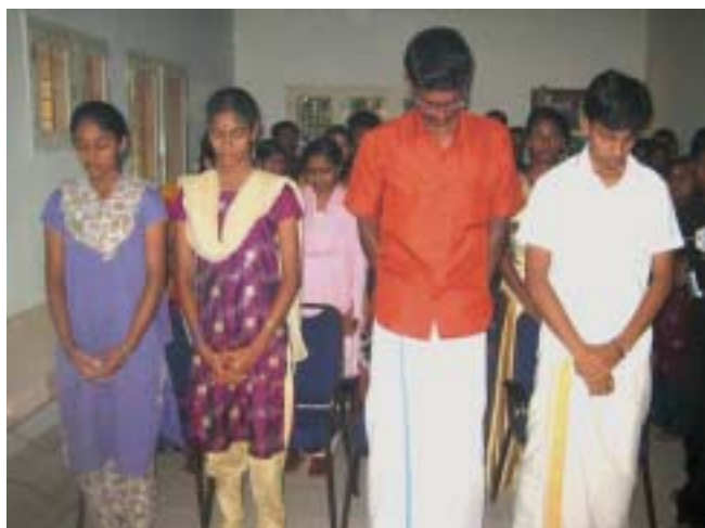
The programme started off with prayer

It was a melting moment to see the students departing with heavy heart and tears, embracing and consoling each other. They ex-