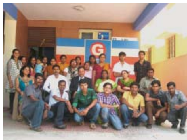
Kerala students with faculty @ G-TEC Indiranagar-Bangalore

pressed their deep feelings that they would be missing GTEC-Indiranagar centre a lot. GTEC Indiranagar-Bangalore wishes many more such visit of the students in future to take up various courses offered at our Centre. GTEC-Indiranagar-Bangalore wishes the students All the Best!!!