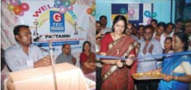
New lab @ G-TEC Pattambi