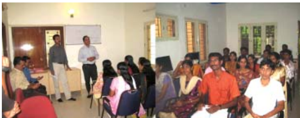
G-TEC Indiranagar-Bangalore welcomes Kerala students

The Kerala students, winners of GATE scheme arrived Bangalore on 31st March 2010. The students were picked up from the Railway station and were taken to their respective hostels and were introduced to the respective Hostel-in-charge. After brief refreshments, the students assembled at GTEC-Indiranagar Centre and an Inaugural Function was arranged to welcome the Students. The Inaugural session began with student Introduction followed by Introduction of faculty to the students. The students were segregated according to the courses opted and each student was given the details of courses proposed to be covered