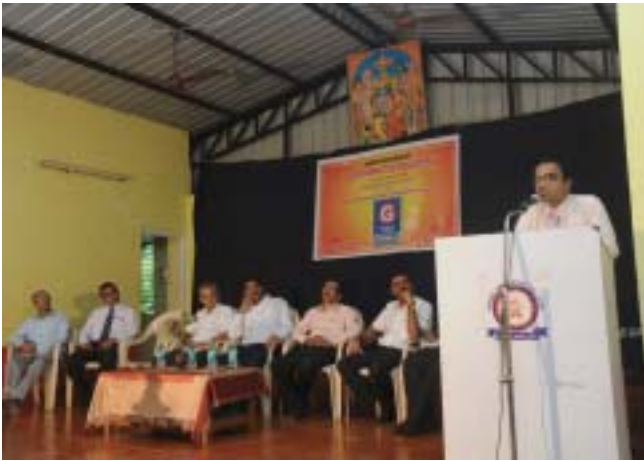
Associate Study Centre, Sri Bharathi College, Mangalore