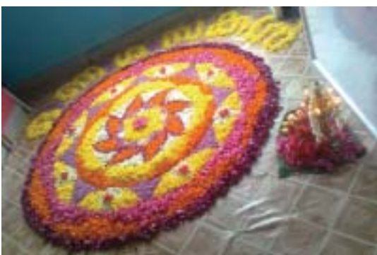
G-TEC SN College, Kollam